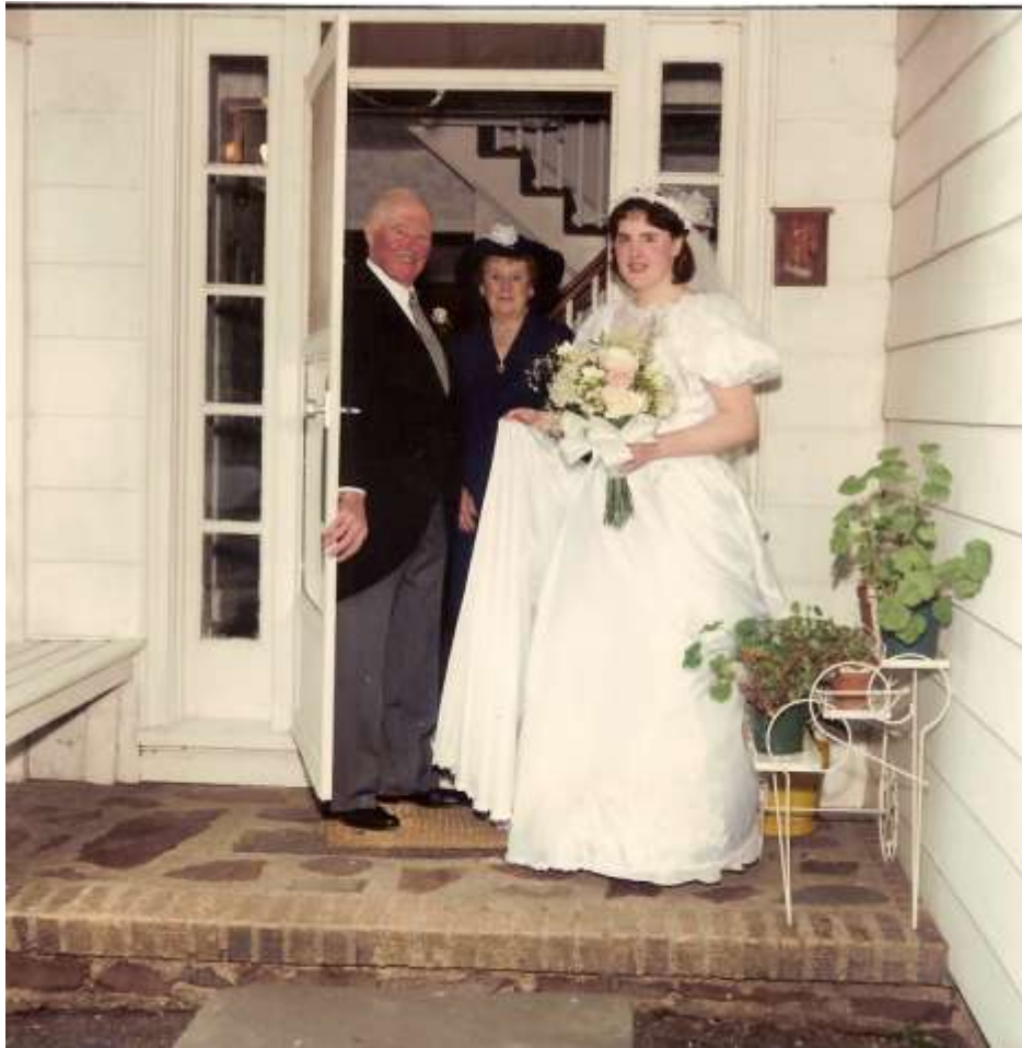
Just leaving the Clarkson Furlong, PA home