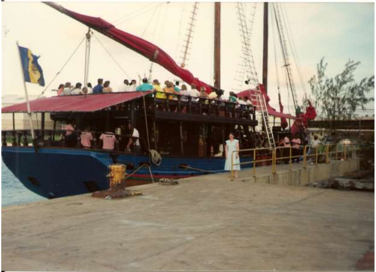
An evening dinner/dance on the Jolly Rodger