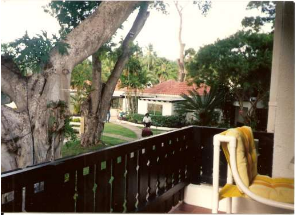
Views from our balcony